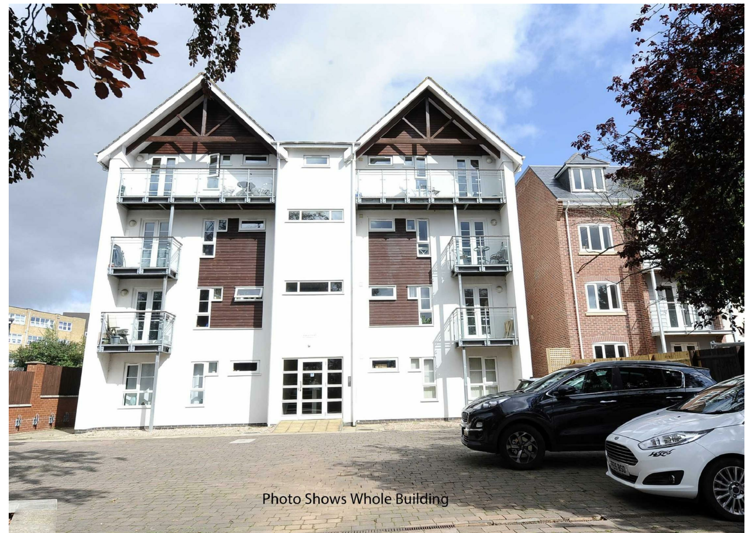
Photo Shows Whole Building

sales 01933 224444 lettings 01933 222233 www.hawksbys.net